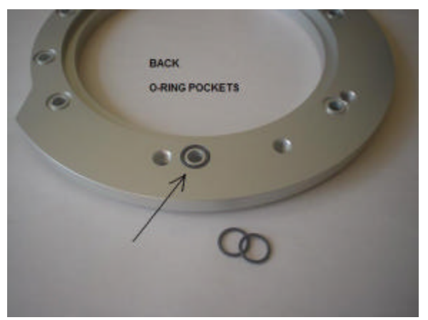
Figure 1 -- adapter back o-rings