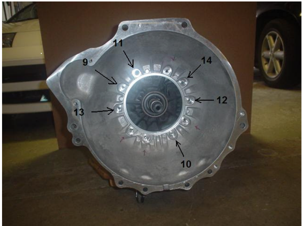
Figure 8 – Short bolt torque sequence