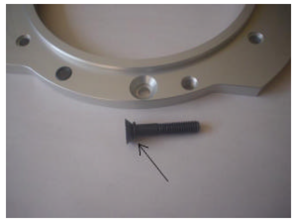
Figure 3 – front o-ring installed on tapered bolt