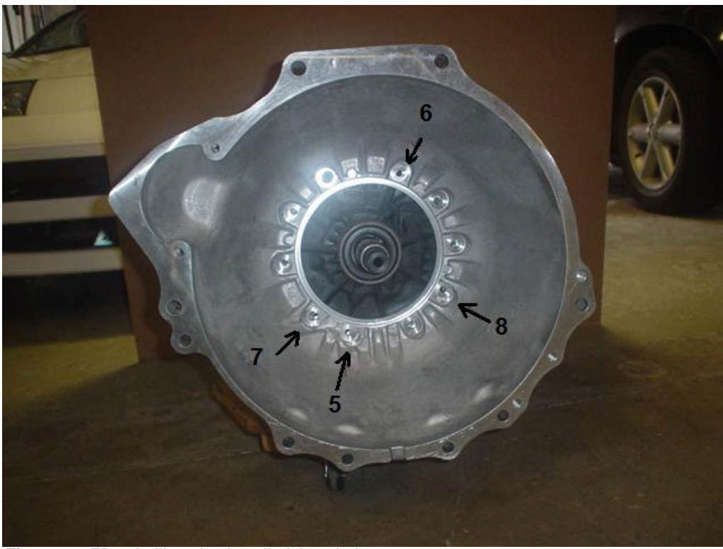
Figure 7 – ZD30 bellhousing installed, long bolt torque sequence

• Place the bellhousing onto the adapter and rotate into position (sight through bolt holes 5, 6, 7, and 8 [Figure 7] which index the entire assembly).