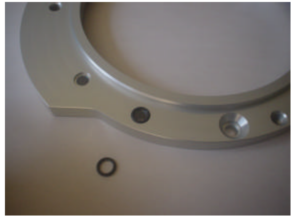
Figure 2 – adapter front o-rings