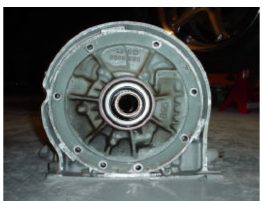
Figure 5 – Machined housing and pump face

• When all four bolts are installed and snug, verify that none of the back o-rings have become dislodged, preventing the adapter from sitting flat on the pump surface.